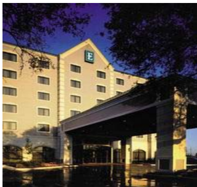
Embassy Suites – Airport Room rate approx. $112.00 5055 International Blvd. N. Charleston, SC (843) 747-1882

A few of the hotels that are convenient to our facility or historic downtown Charleston are noted below, and also offer government rates. Please contact the hotel directly and request the BERCHTOLD Corporation negotiated rate when making your reservation.