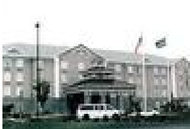
Holiday Inn Express Room rate approx. $95.00 7670 Northwood Blvd. N. Charleston, SC (843) 553-1600