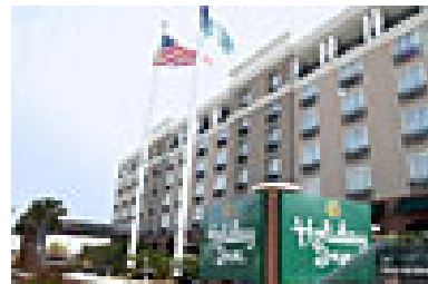
Holiday Inn Charleston (Historic District) Room rate approx. $150.00 125 Calhoun Street Charleston, SC (843) 805-7900

Contact BERCHTOLD Corporation Technical Service for additional information about lodging and availabilities.