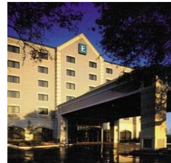
Embassy Suites – Airport Room rate approx. $119.00 5055 International Blvd. N. Charleston, SC (843) 747-1882