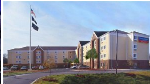
Candlewood Suites Room rate approx. $109.00 2177 Northwood Blvd. N. Charleston, SC (843) 797-3535