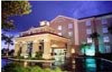
Holiday Inn Express Room rate approx. $109.00 7670 Northwood Blvd. N. Charleston, SC (843) 553-1600

A few of the hotels that are convenient to our facility or historic downtown Charleston are noted below, and also offer government rates. Please contact the hotel directly and request the BERCHTOLD Corporation negotiated rate when making your reservation.